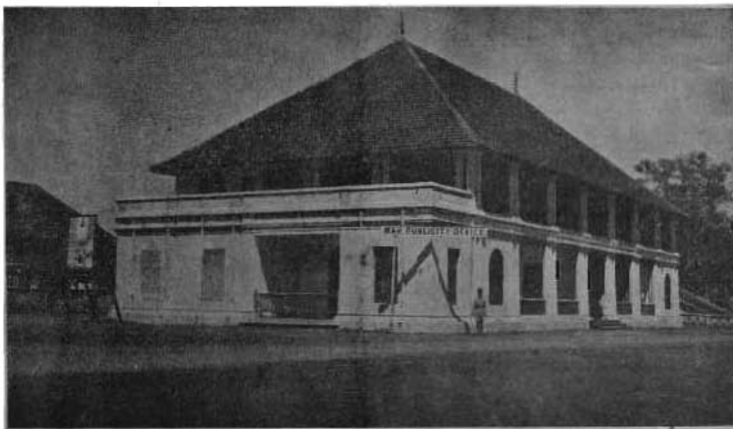
The Darbar Hall, Ernakulam

your wise guidance supported by the loyal and spontaneous co-operation of a grateful people, without which, I need hardly remind Your Highness, your individual effort can be of little avail, the Cochin State will continue to play a worthy part in the common effort not only to achieve victory but in the still graver task of achieving a just and lasting peace. May God keep you strong and steadfast in that purpose."